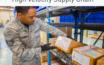
High Velocity Supply Chain