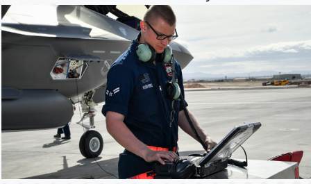
Predictive Health and Advanced Analytics