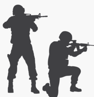
Special Operations Support

North Carolina is home to the development and production of several Lockheed Martin key mission portfolios, to include: