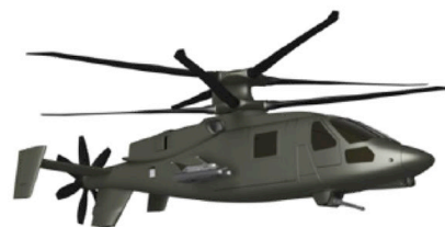
MH-97 Troop Assault, Special Ops