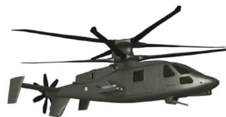
AH-97 Recon Light Attack