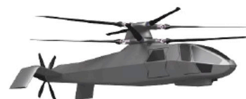
RQ-97 Autonomous Recon Attack