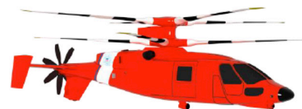
Search and Rescue