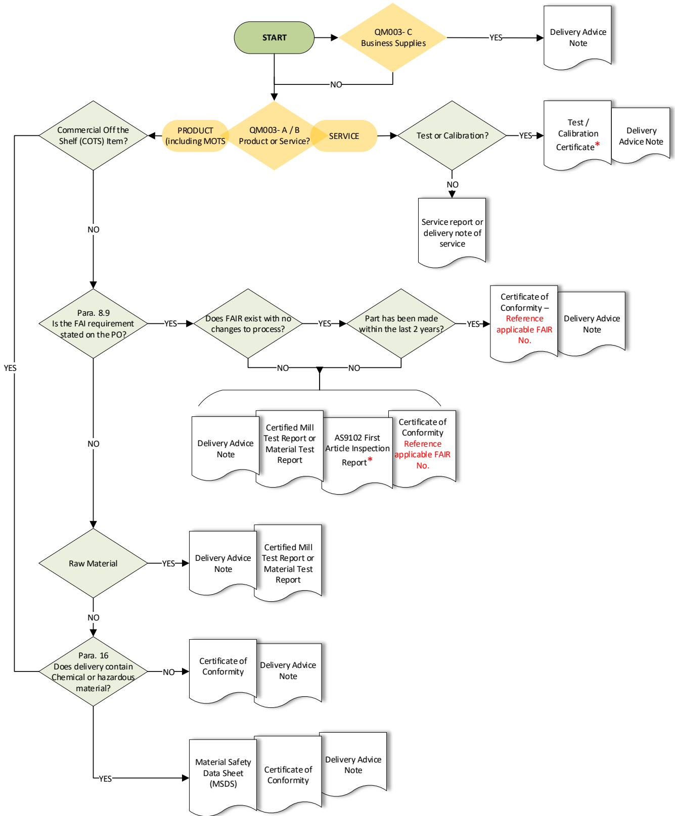
Diagram 2 – Delivery documentation requirement flowchart

* First Article Inspection Reports shall be submitted electronically prior to shipment of goods to fai.fc-amphill@lmco.com