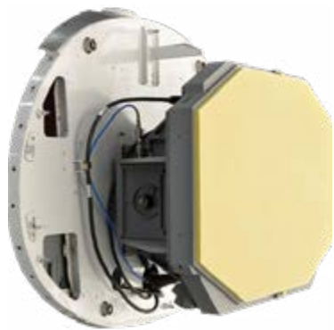
APG-83 Active Electronically Scanned Array (AESA) Radar