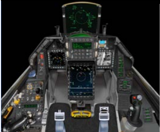
1. Left Photo: New Advanced Viper Block 70/72 Cockpit 2. Right Photo: Center Pedestal Display, Targeting and SAR Imagery