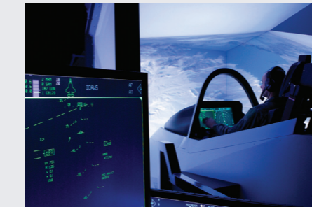
Sector 6 - Tangier