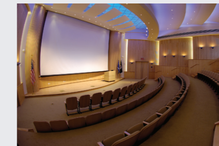
Sector 2 - Thimble Shoal Auditorium