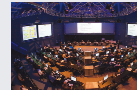
Sector 4 - Mobjack