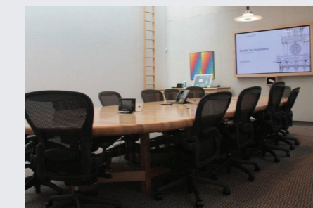
Cape Lookout and Cape Henry Conference Rooms