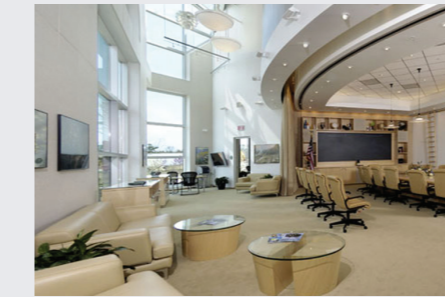
Sector 1 - Cape Hatteras Conference Room