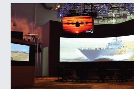
Sector 5 - Chincoteague